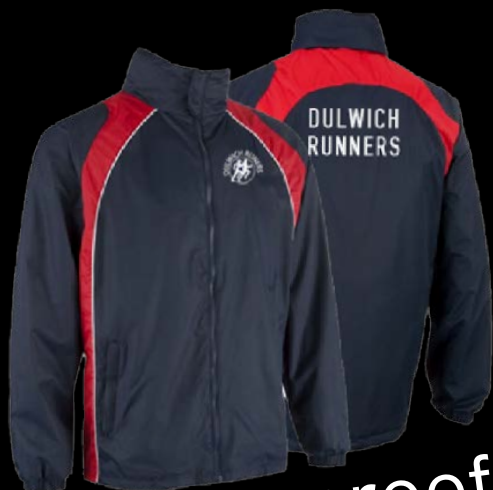
Showerproof Team Jacket