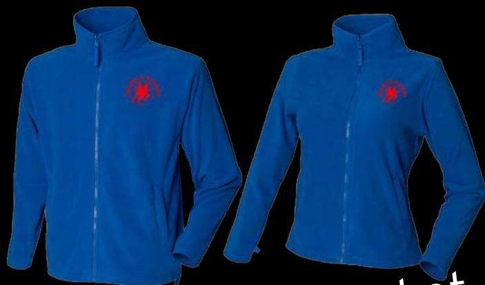
Micro Fleece Jacket