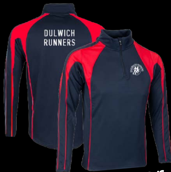
Pro Mid Layer 1-4 Zip Top