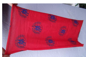
Bufs/snoods - only £6