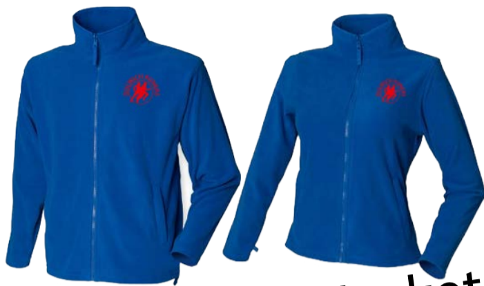
Micro Fleece Jacket