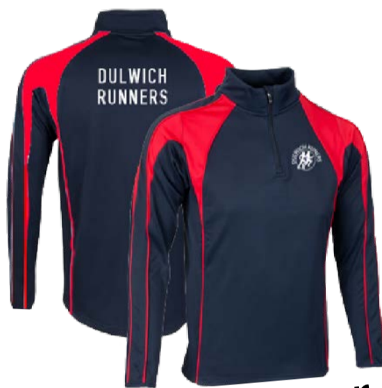
Pro Mid Layer 1/4 Zip Top