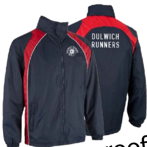
Showerproof Team Jacket