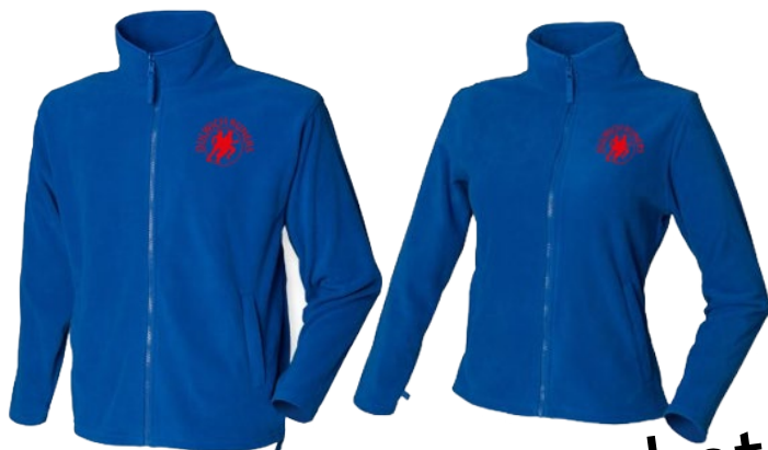
Micro Fleece Jacket