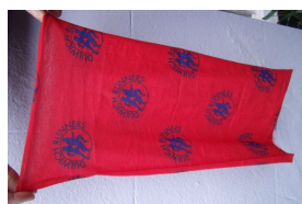
Bufs-snoods - only £6