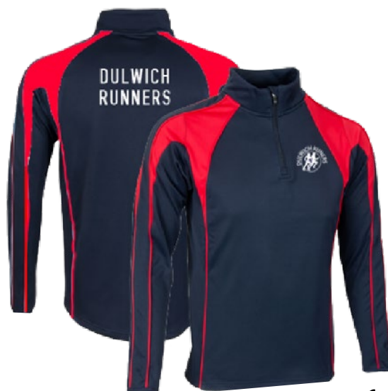
Pro Mid Layer 1-4 Zip Top