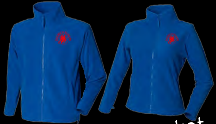
Micro Fleece Jacket