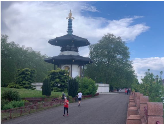
The Peace Pagoda, Battersea Park