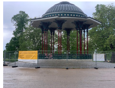
The Grade 2 listed bandstand

Leading male time is held by Tim Bowen (1:57), leading ladies time is held by Tess Bright (2:10).