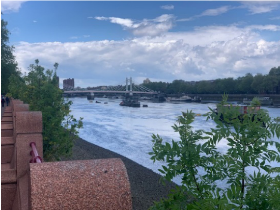
Along the Thames towards the Albert Bridge