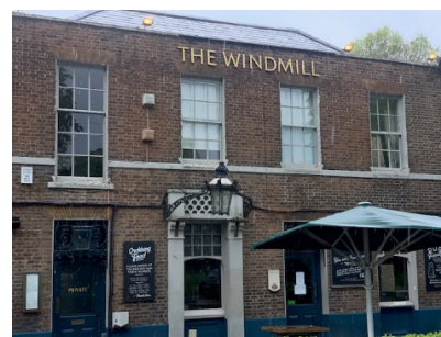
The Windmill On The Common.