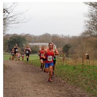
Running on the trails