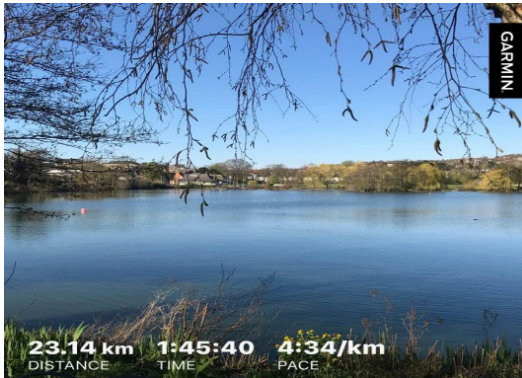
The Lake of South Norwood

In the third part of the series we look at some of the parks around Dulwich that we run around for training, parkruns and racing. As with the previous two parts, I have looked at a brief history of the park, as well as running options and Strava segments. For this week, we look at some of the parks that are slightly further afield from the clubhouse.