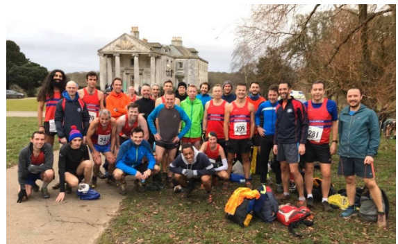
The mansion post Surrey league 2020