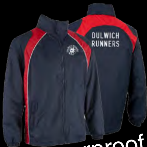
Showerproof Team Jacket