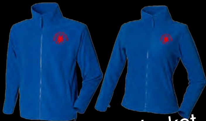
Micro Fleece Jacket