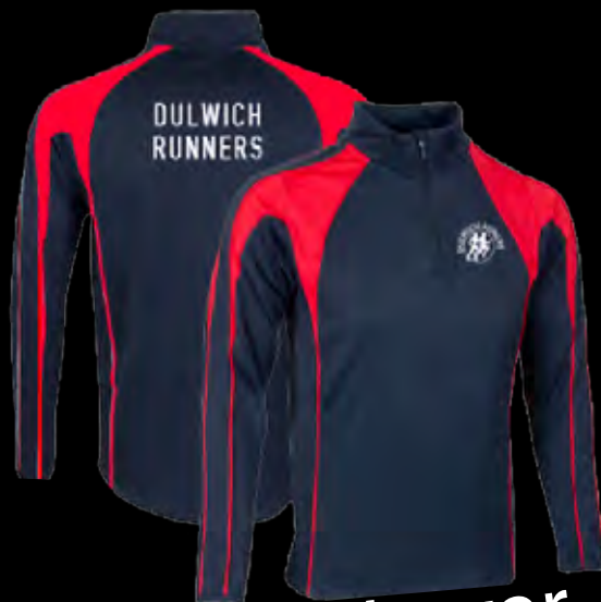
Pro Mid Layer 1-4 Zip Top