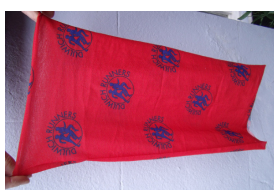
Bufs/snoods - only £6