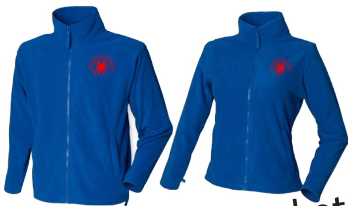
Micro Fleece Jacket