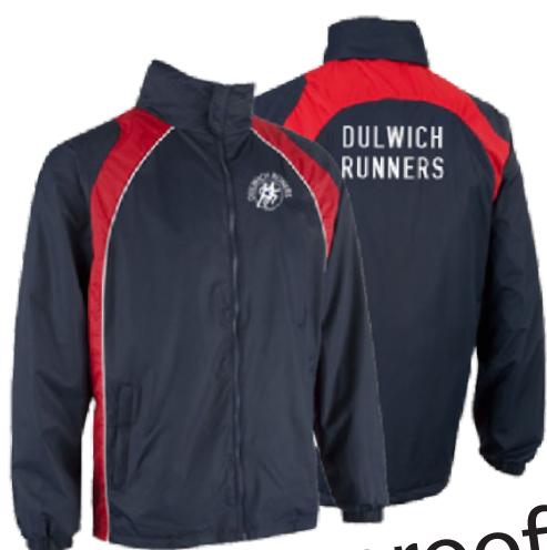
Showerproof Team Jacket