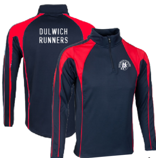
Pro Mid Layer 1/4 Zip Top