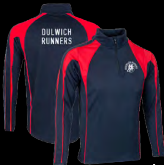
Pro Mid Layer 1-4 Zip Top