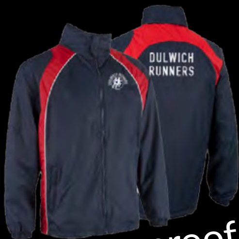
Showerproof Team Jacket