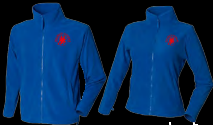
Micro Fleece Jacket