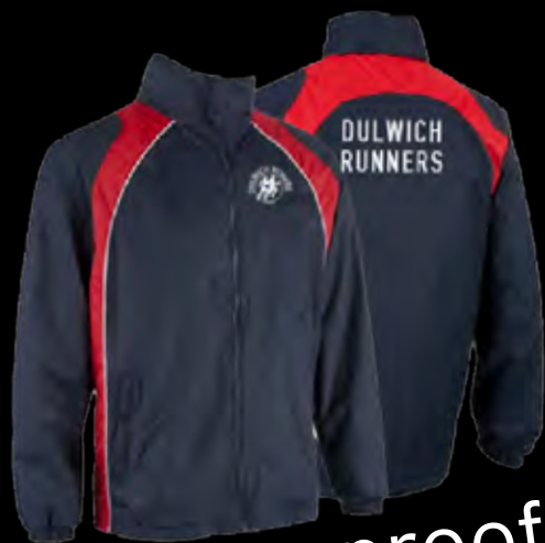
Showerproof Team Jacket