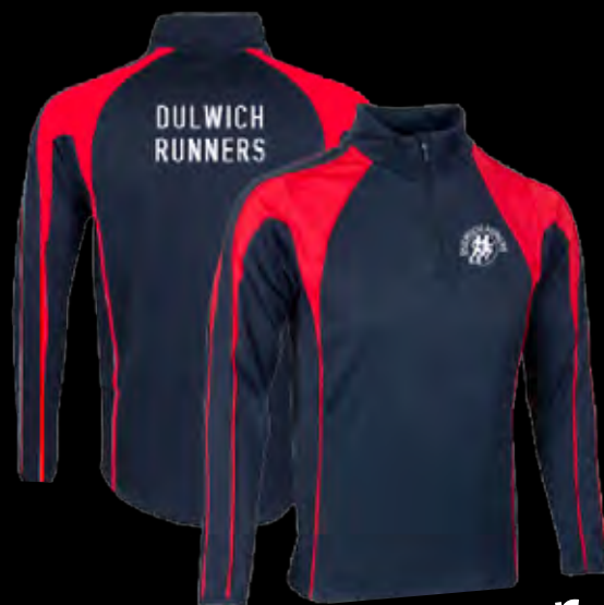
Pro Mid Layer 1-4 Zip Top