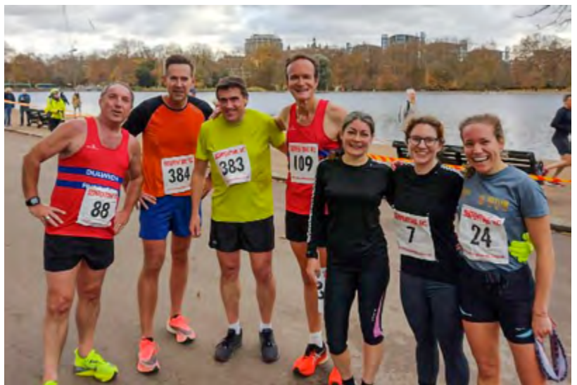
GB IL PD EP KS AT BS