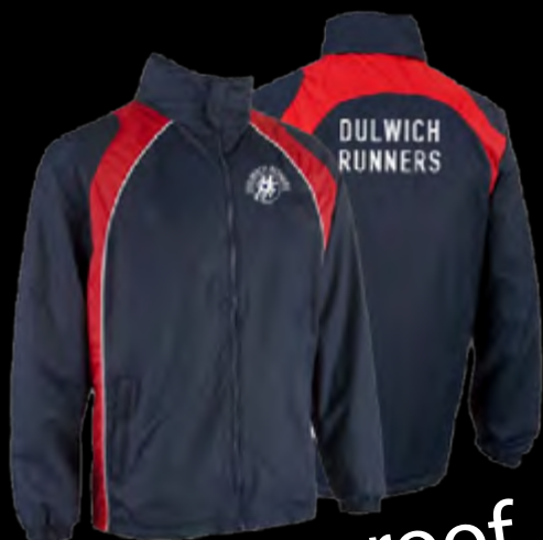
Showerproof Team Jacket