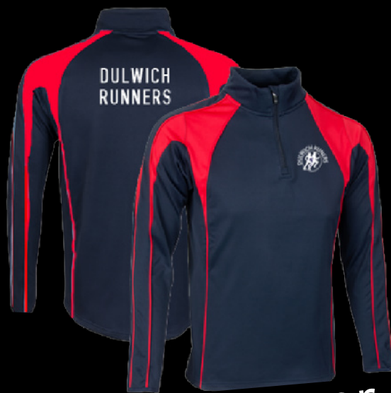
Pro Mid Layer 1-4 Zip Top