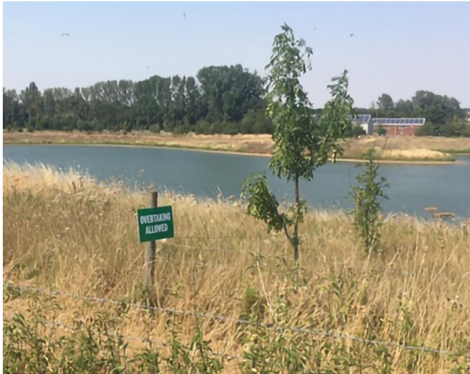
Overtaking allowed !