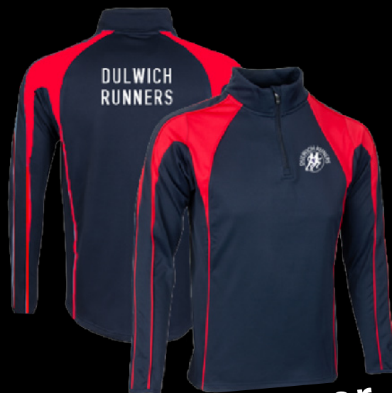
Pro Mid Layer 1-4 Zip Top