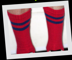
Socks only £5