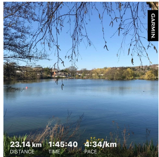
South Norwood Lakes

Once at the far end of the lake there is a short climb past the stadium on your right until you reach the station where you will exit the park.