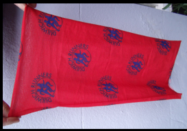
Bufs-snoods - only £6

Most kit is usually available Wednesdays at the club from Ros ros.tabor49@gmail.com