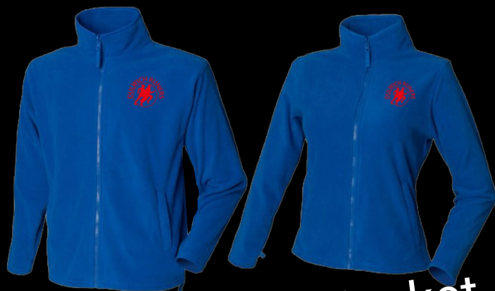
Micro Fleece Jacket