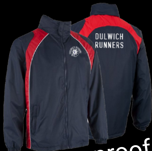
Showerproof Team Jacket