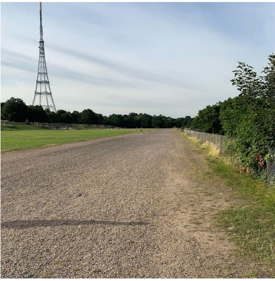
A view of Crystal Palace Park, though the run doesn't reach this part of the park

Once on Anerly Hill turn left and cross the road and be ready to turn right into Hamlet Road and then a left into Maberly Road.