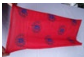
Bufs/snoods - only £6