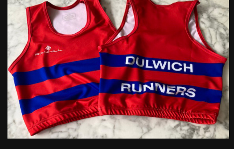
Crop tops - £25

DULWICH RUNNERS' SHORTS - All sizes available Traditionally cut either 'racing' style, or slightly longer – Both styles are a bargain £15.