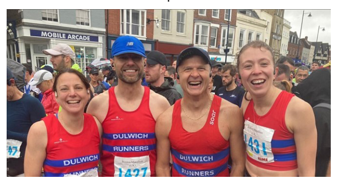
Delusional smiles pre-race start!

I think what we managed to achieve on Sunday was incredible, true Dulwich Runner grit. Through the chattering teeth and shivers we all managed to have a smile and a very soggy hug. Fortunately, none of us had hypothermia unlike some others. On a drier day would be a very pleasant run!