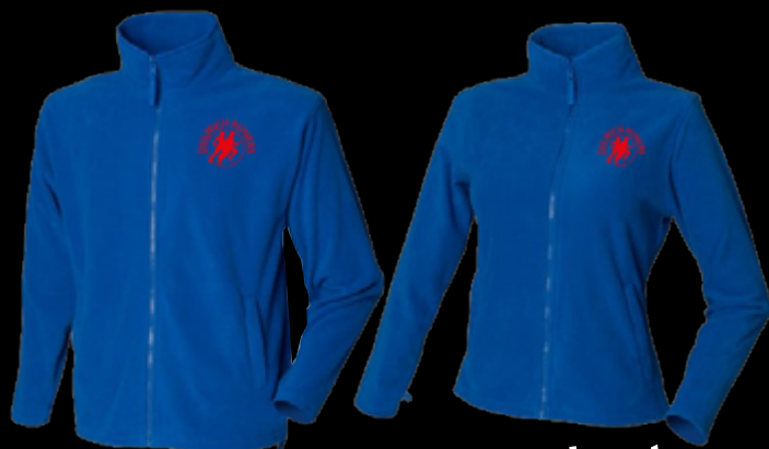
Micro Fleece Jacket