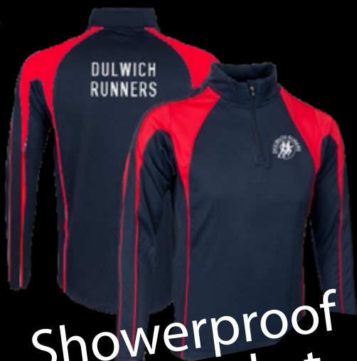
Showerproof Team Jacket