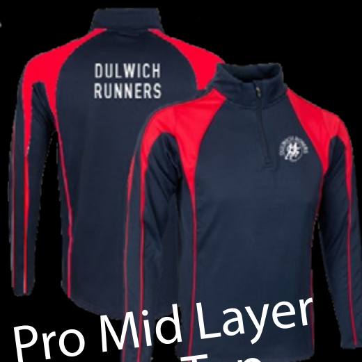
Pro Mid Layer 1-4 Zip Top